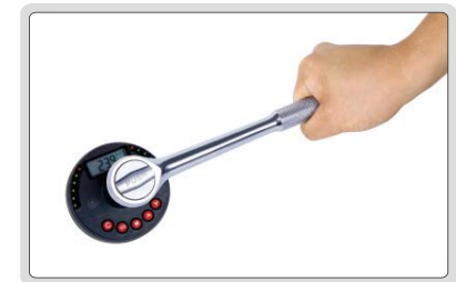
working with ordinary wrenches