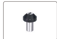
small V-type anvil (optional) for cylinders with diameter Ø2~4mm