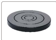
Ø150mm flat anvil (included)