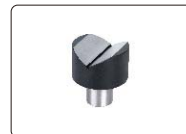
V-type anvil (included) for cylinders with diameter Ø4~60mm