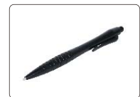
touch pen (included)