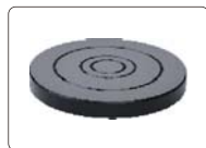
Ø150mm flat anvil (included)