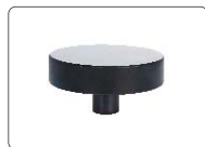
Ø63mm flat anvil (included)