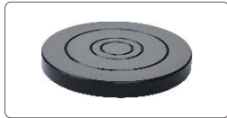
Ø150mm flat anvil (included)