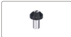
small V-type anvil (optional) for cylinders with diameter Ø2~4mm