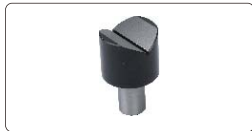
V-type anvil (included) for cylinders with diameter Ø4~60mm