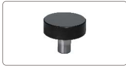
Ø60mm flat anvil (included)